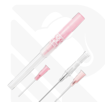
Mouse endotracheal intubation tube