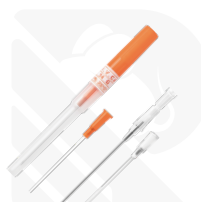
Rat endotracheal intubation tube