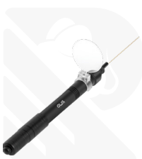
Endotracheal intubation fiber optic lighting kit