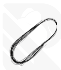
Silk yarn for teeth bar