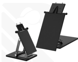
Rat and mouse endotracheal intubation stand