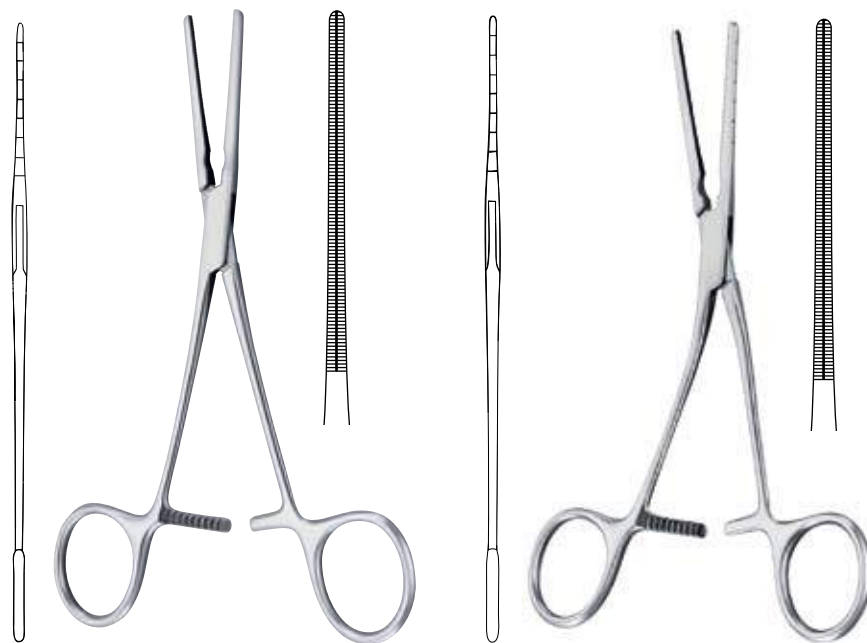
COOLEY PATENT DUCTUS CLAMP